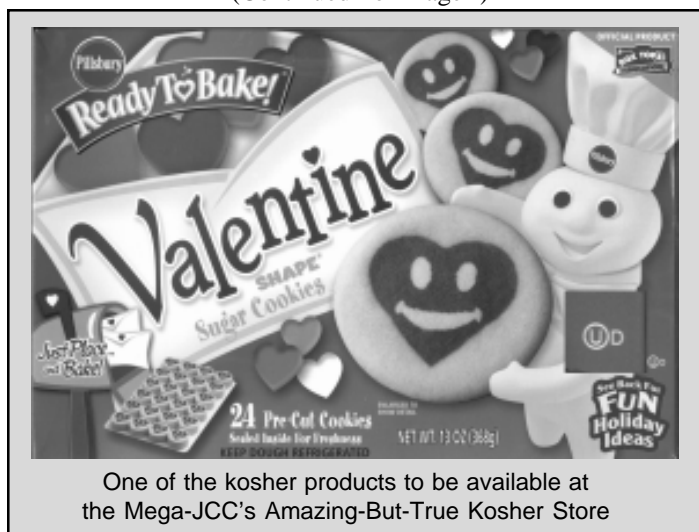
One of the kosher products to be available at the Mega-JCC's Amazing-But-True Kosher Store

So watch for the store opening, and if the manufacturers are still in business in 2012, and still producing the items on this list, you can be among the first to shep nachas from serving your Shabbat guests Kosher certified Easter eggs, chicks, and bunnies; Halloween candy bats; Night Before Christmas cookies; jelly wreaths, and candy bells.